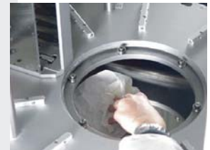
Pic.: Easy Access